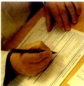
Complete a pre screening questionnaire