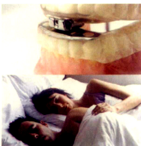
Patient wearing Sleepwell™